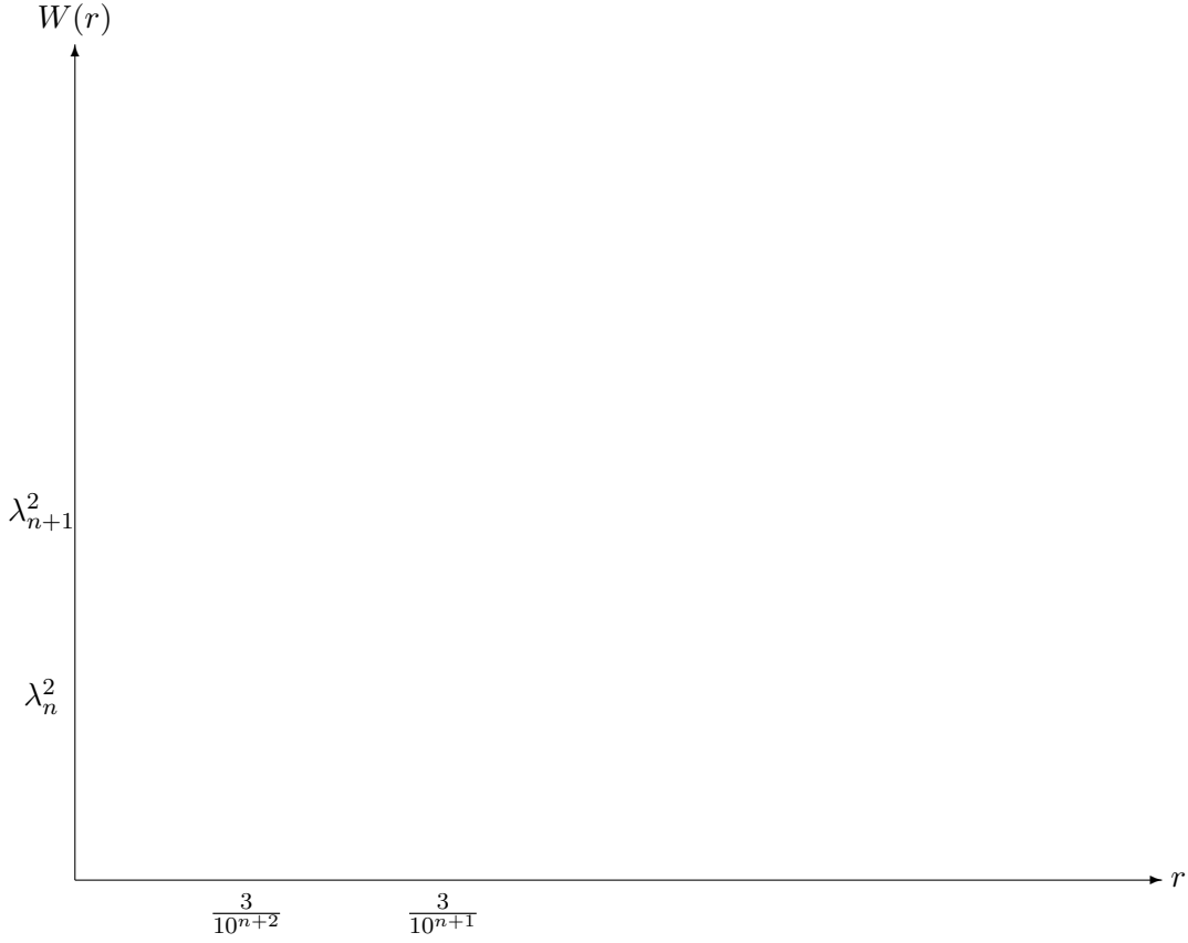
FIGURE 2. The potential W

We shall denote by y_n and b_n the following functions: